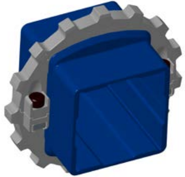
UltraFit Two-Part Sprocket System: sprocket and adapter

Adapters are available for popular bore sizes and in two widths: 25.0 mm (0.98 in) and 76.0 mm (2.99 in).